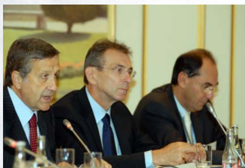
Photo from left to right: Eurogas President, Domenico Dispenza, EU Commissioner Andris Piebalgs and First Vice President of the European Parliament, Alejo Vidal Quadras

This event was attended by around two hundred high ranking representatives of the European Institutions, Industry, International Organizations, Producing Countries, Customers and the Press. The highlights were on the progress made in the internal market, on a first assessment of the proposed "Third legislative package", on European company strategies and on partnerships with external producers. This conference was also the occasion for a large debate on investment issues, consumer protection, regulation and harmonization in the context of the legislative proposals launched by the Commission.